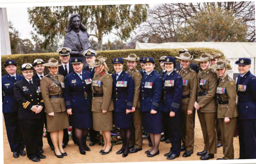
Australian Military Service Personnel