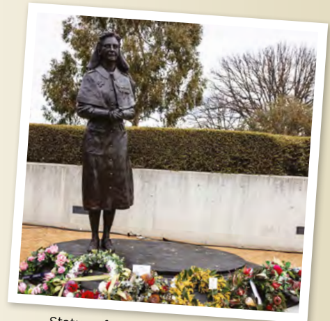
Statue of Lt Col Vivian Bullwinkel at the Australian War Memorial

Thank you to our Founding Sponsors. The ACN Foundation would like to thank all donors. Every donation contributes to ensuring the success of this important project.