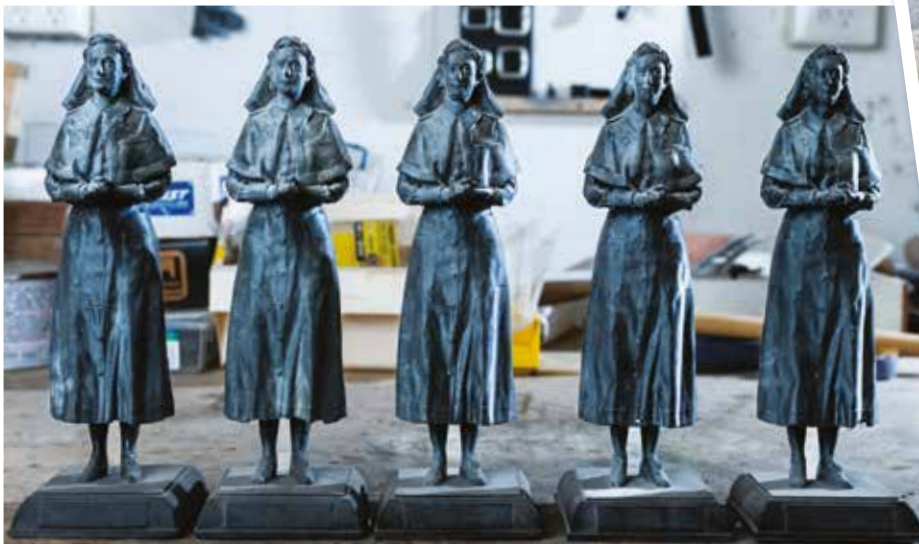
Above: Progress image